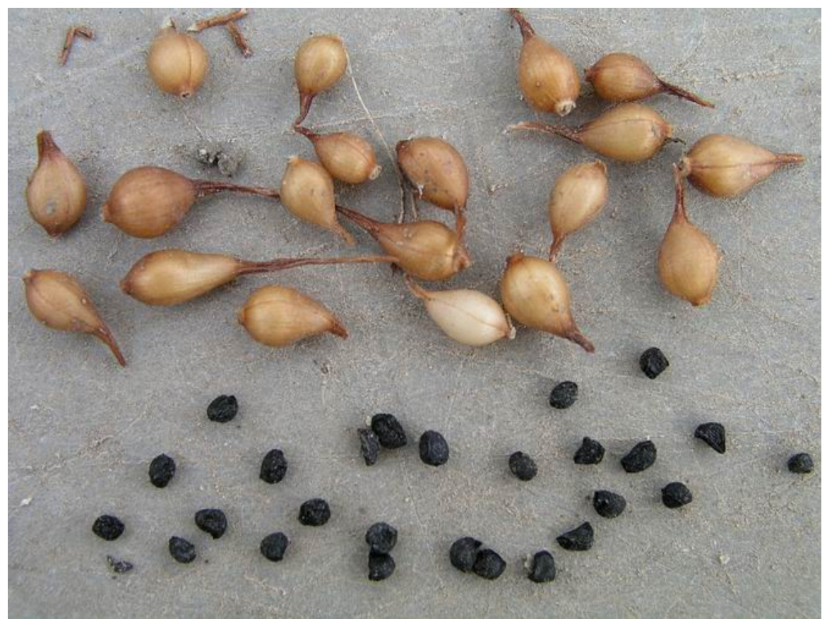
First year narcissus sown deep

If you compare the way Fritillaria seed and Narcissus seed behave at germination you will find that in Fritillaria the growth tip pushes down into the compost and the bulb forms at the end of this tip where as in Narcissus the bulb forms beside the seed and the roots penetrate the compost. The Narcissus bulb then in subsequent years forms contractile roots that gradually pull the bulb down to its preferred depth.