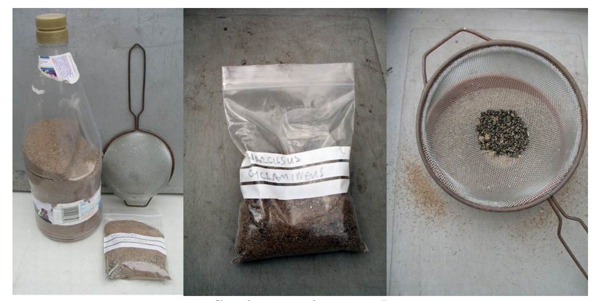
Storing narcissus seed

We store our Narcissus seed in almost dry fine sand that has been passed through a kitchen sieve. The seed and sand are placed into a zip lock plastic bag which is stored in a dark place that is not subjected to large temperature fluctuations, a tin box in a shaded shed. When we are ready to sow the seed we pour the contents of the packet back into the sieve and the sand passes through the mesh leaving the seed ready to sow.