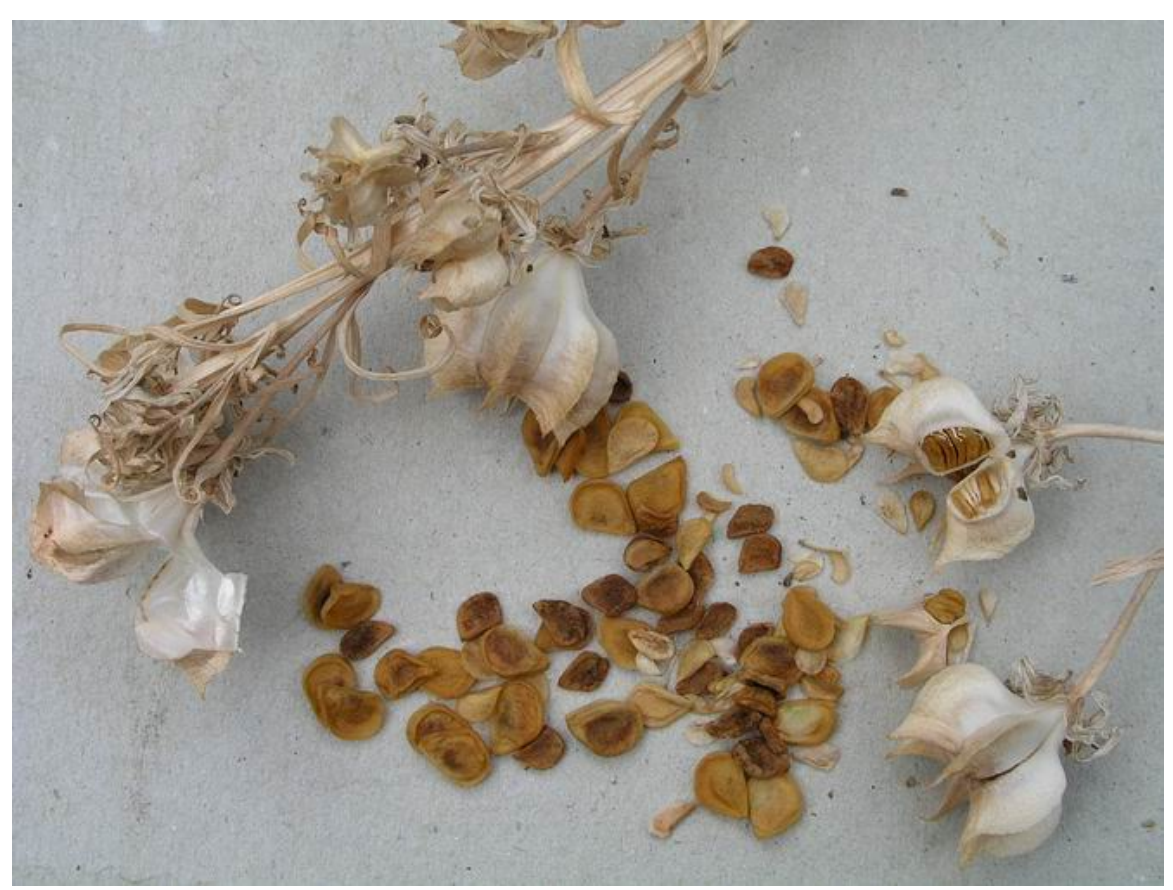
Fritillaria pluriflora seed

Fritillaria seed should be sown at the beginning of September/October and watered well, just like the mature bulbs. You can successfully sow Fritillaria seed up to late November and possibly December. If I receive Fritillaria seed after December I do not sow it until the following September, as germination in the first season would be poor, if at all, because you have missed the time window for Fritillaria and there is every chance that the ungerminated seed would rot off in the long period of unfavourable conditions of a Scottish spring and summer before the next time window comes round. The North American fritillaries are an exception to this and I know people who have had a good early germination following a January/February sowing – I am convinced that the American frits are very different breed to the old world frits.