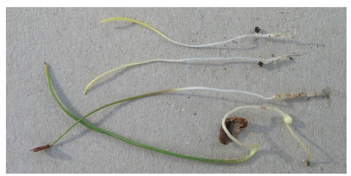
Frit and narcissus seeds germinating

If you compare the way Fritillaria seed and Narcissus seed behave at germination you will find that in Fritillaria the growth tip pushes down into the compost and the bulb forms at the end of this tip where as in Narcissus the bulb forms beside the seed and the roots penetrate the compost. The Narcissus bulb then in subsequent years forms contractile roots that gradually pull the bulb down to its preferred depth.