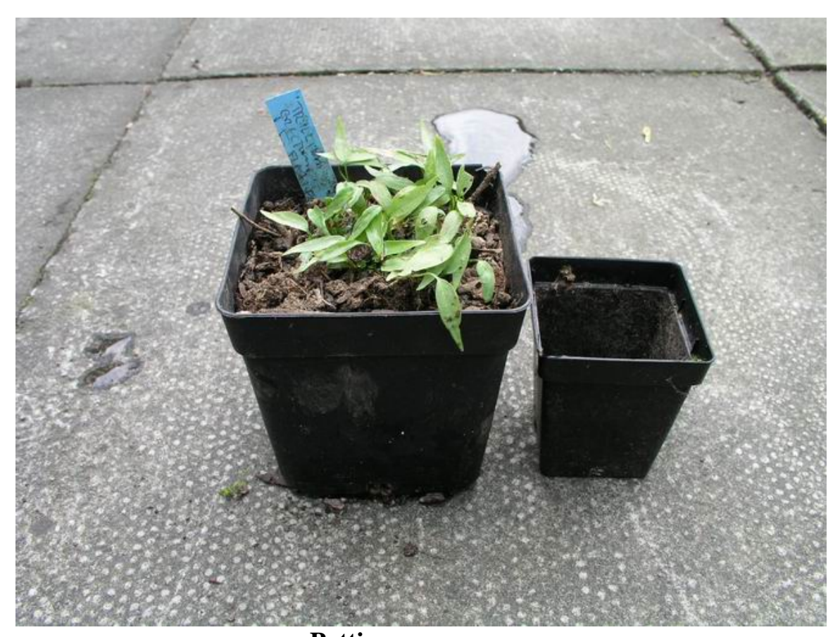
Potting on en masse

If you have sown Narcissus, Crocus, etc on the surface they may be the exception to the delayed repot rule: there is a big advantage in getting them down deeper into the compost as soon as possible—it is much better to sow them deeply in the first place.