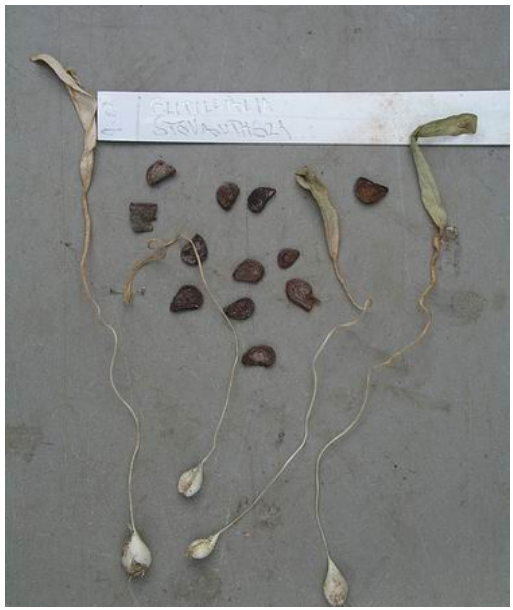
1st year Frit seedlings

Look how deep these Fritillaria bulbs have taken them selves in their first year of germination: learn this lesson from the bulbs and never be afraid to plant them that bit deeper - they will be able to get their leaves up to the surface.