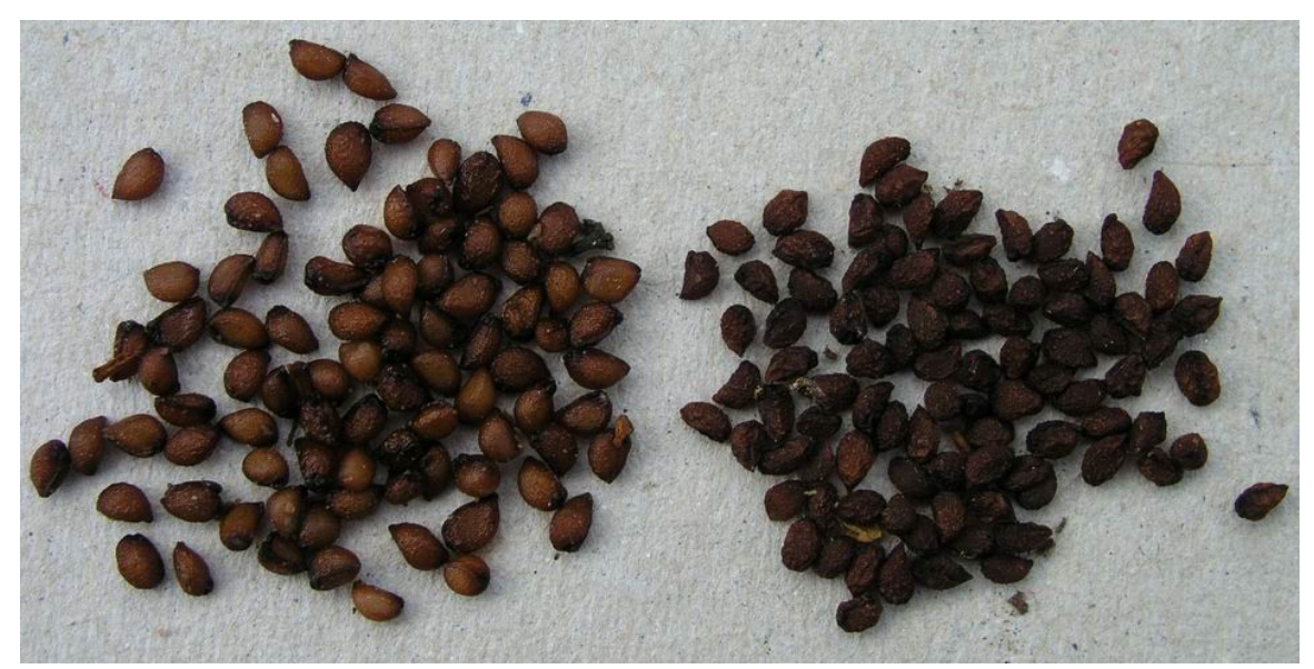
Soaked and unsoaked Erythronium seed

Cyclamen and other similar types of seeds are best sown fresh or as soon as you can get them. If they are a bit dry and wrinkled a good soak overnight in water with a tiny smear of soap, just enough to break the surface tension, should make them nice and plump again and improve germination; the same applies to Trillium seeds.