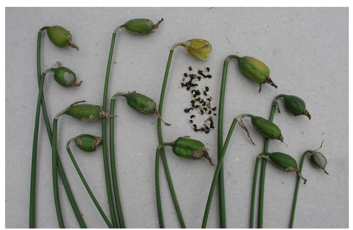
Collecting Narcissus seed

You should also collect and sow some seed of all your own bulbs on a regular basis to ensure that if they are unfortunate enough to get struck by a disease or a virus you will always have healthy young stock coming on. Much is written about not letting your bulbs set seed as this weakens the bulb; this is nonsense. A bulb that is setting seed will grow from four to six weeks longer than the same bulb would if it was not fertilised: this extra growing time more than makes up for the energy the plant needs to produce the seed. It is very important that we all collect and circulate as much seed from our cultivated bulbs as we can. We never know when wild sources of seed will dry up, either by extinction of the plants in the wild or by legislation forbidding seed collection, so we must look to preserve as wide a range of cultivated material as possible.