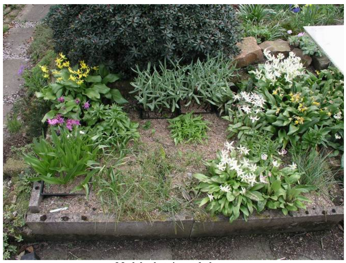
Mesh baskets in sand plunge

Some Narcissus and Crocus will flower in three years from seed as will many lilies but it is normal to have to wait until year five to seven for Fritillaria and Erythronium.